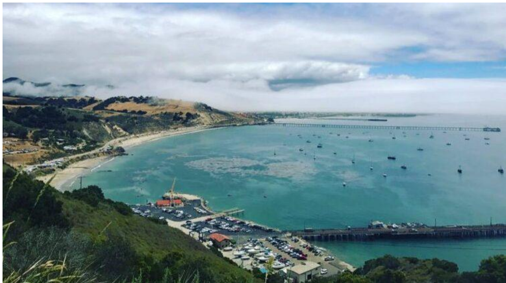
Port San Luis